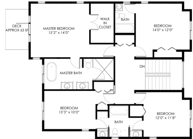
UPPER FLOOR 1354 SF